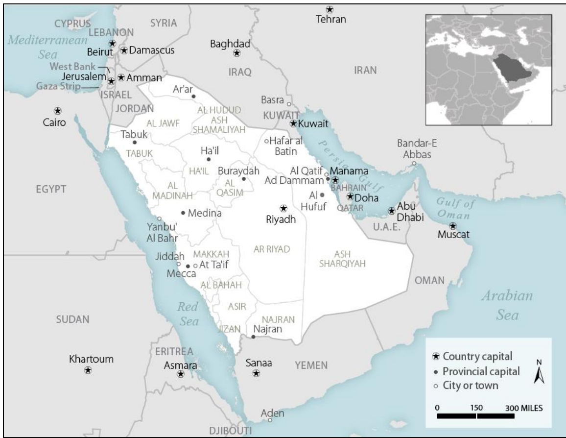
Table I. Saudi Arabia Map and Country Data

Land: Area, 2.15 million sq. km. (more than 20% the size of the United States); Boundaries, 4,431 km (~40% more than U.S.-Mexico border); Coastline, 2,640 km (more than 25% longer than U.S. west coast)